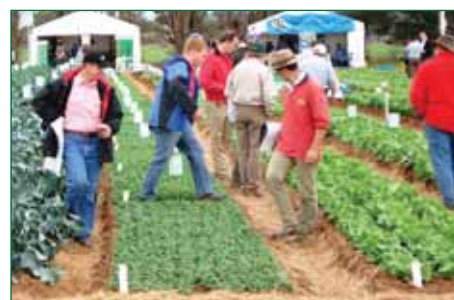
The variety trials looked terrific this year