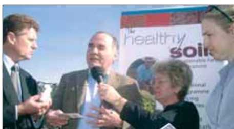
The Soil Health 'UTE' guide was officially launched at the EXPO.