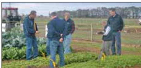
The variety trials attracted huge interest