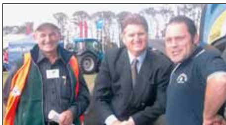
The Minister for Agriculture, the Hon. Peter McGauran (centre) visited the Expo and met many of the exhibitors.