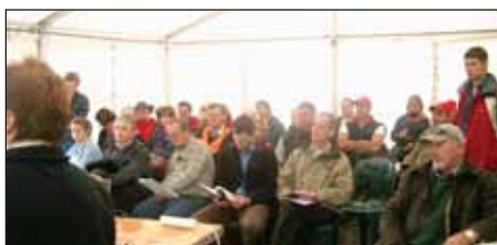
The white blister seminar at the EXPO was well attended