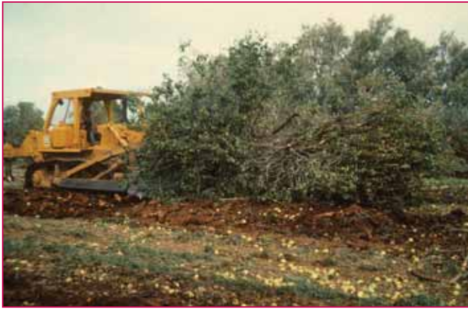
Williams Pears were made uneconomic when cyhexatin resistance was first detected in twospotted mite and replacement chemistry was still being developed.

Resistance in these three major agricultural pests has caused whole cropping systems to be abandoned. The sustainability of modern agriculture is now intricately linked to effective resistance management.