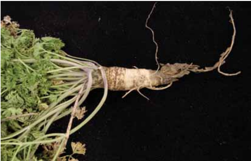
Basal soft root rot of parsley plant