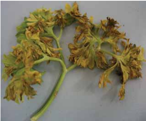
Advanced Alternaria infection