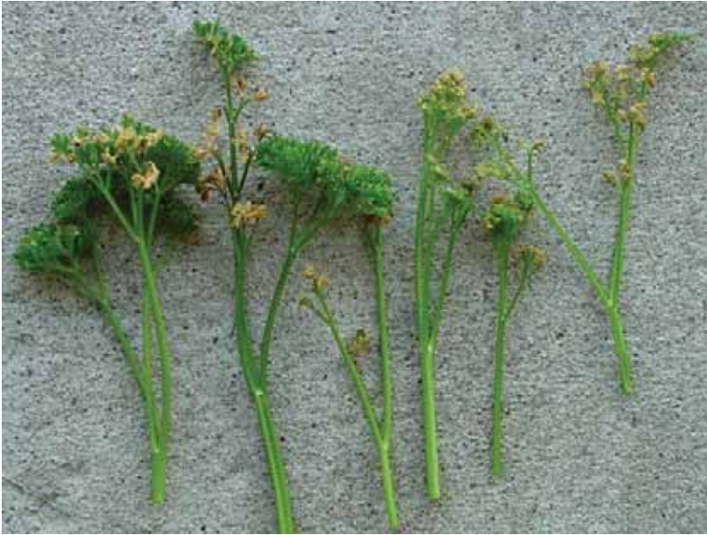
Blight of young leaves