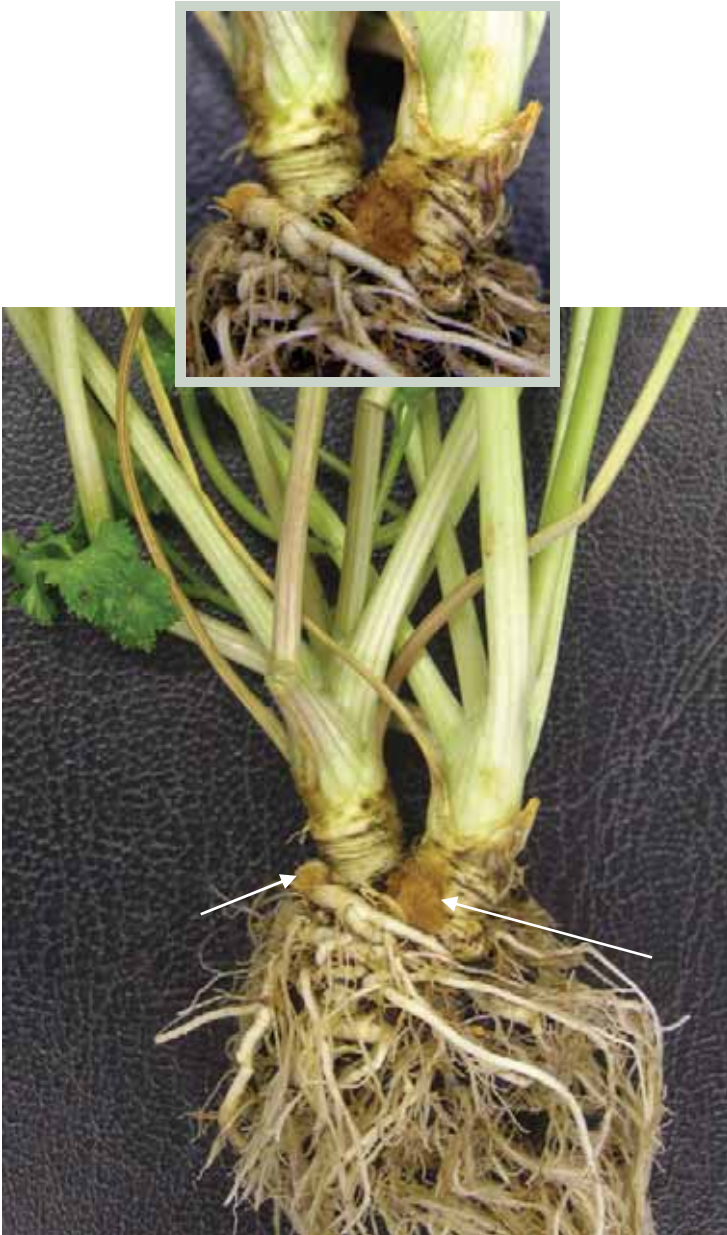
Reddish brown sunken lesions developing on parsley roots