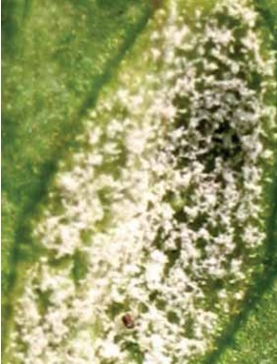
White-grey spores of downy mildew on the undersurface of a leaf