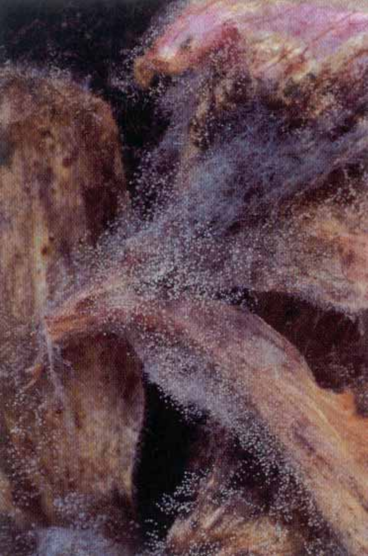
Grey sporulation of Botrytis cinerea