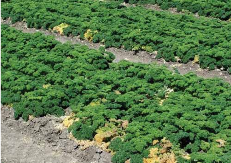
Suspect symptoms of Carrot Red Leaf Virus