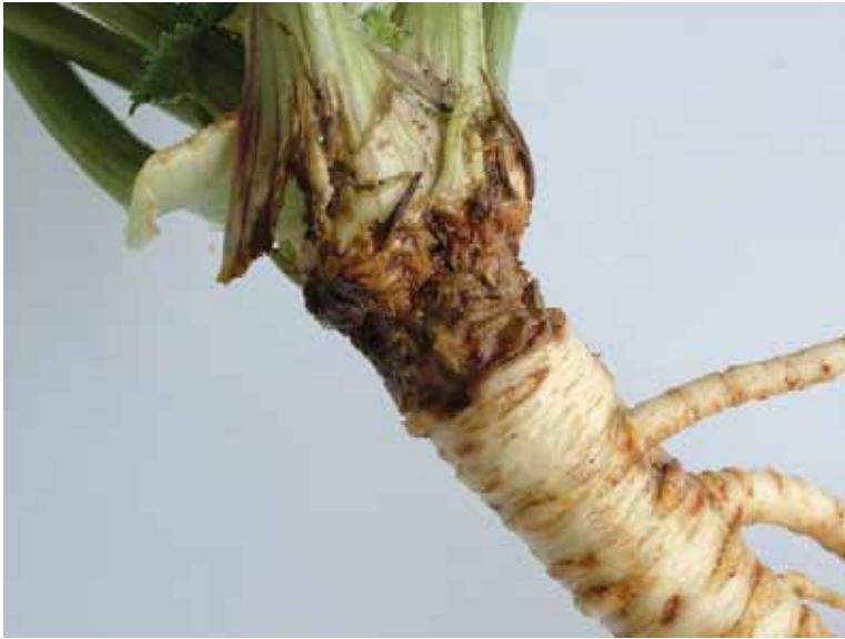
Crown and root rot of parsley