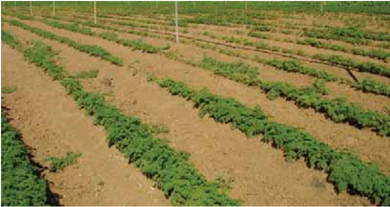
Field infested with root-knot nematodes