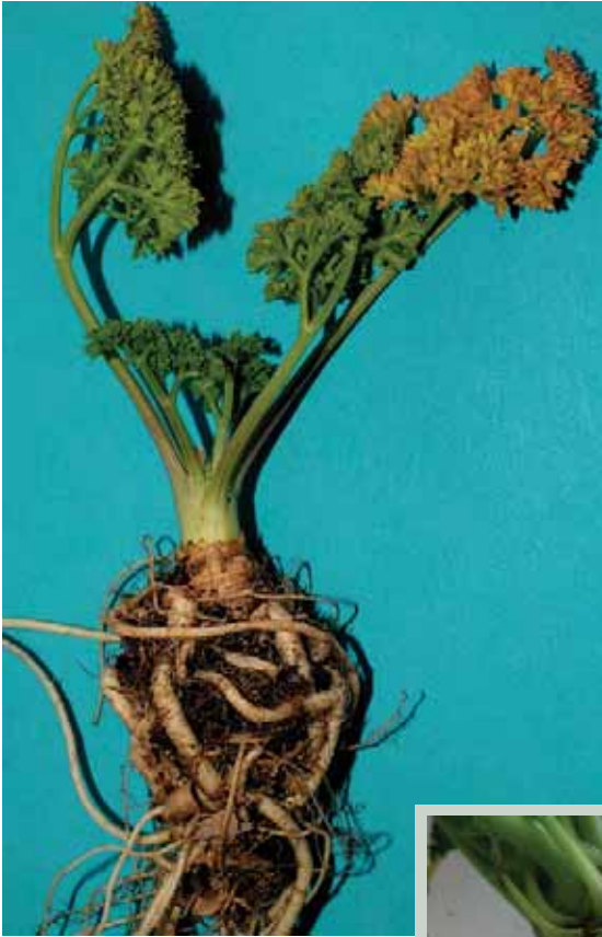
Root balling of parsley