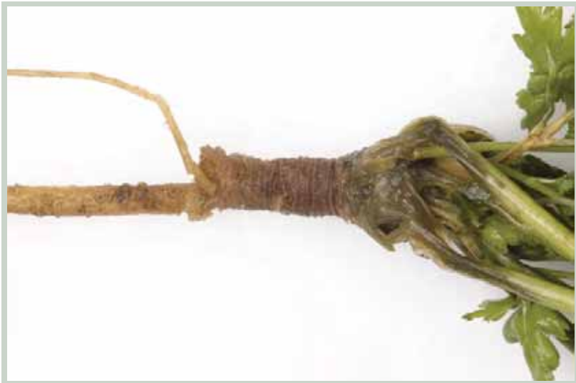
Pythium symptoms of soft, watery rot of basal stems, lack of lateral roots and dull, spongy appearance of upper tap root