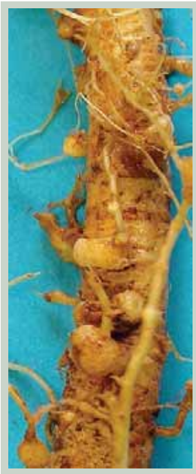
Main taproot of parsley showing galls.