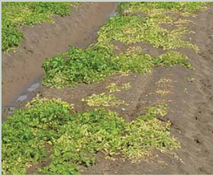
Plant collapse of mature parsley due to Phytophthora and/or Pythium infection