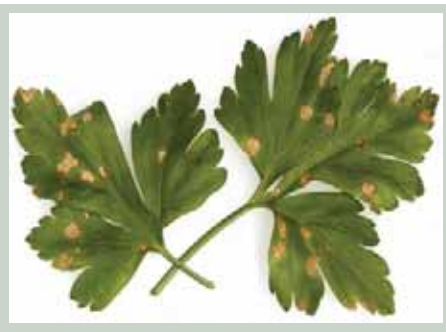
Leaf blight on parsley leaf