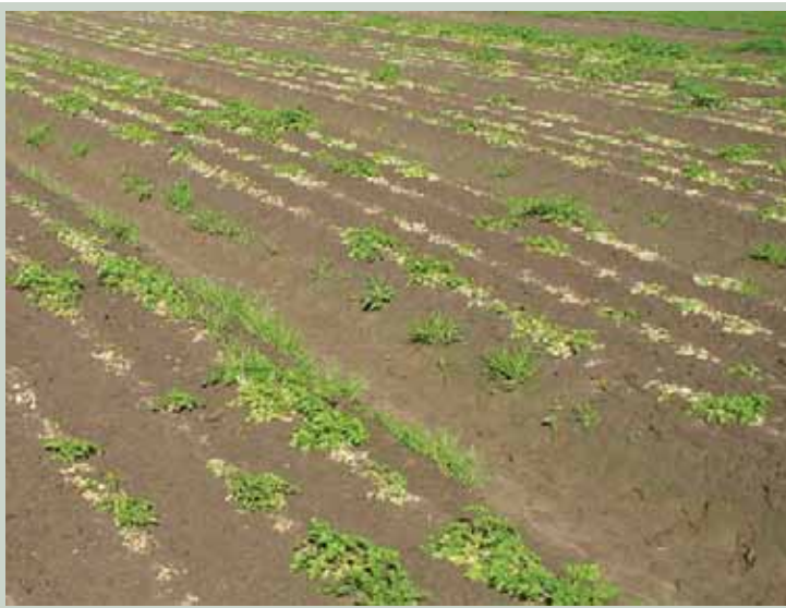
Parsley field with post-emergence damping off