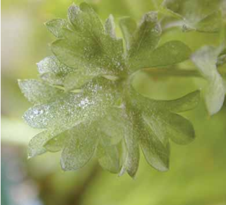
Upper surface of leaf