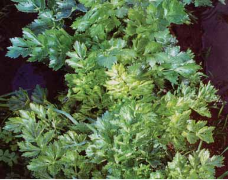
Yellowing of parsley leaves caused by Apium Virus Y