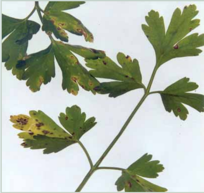
Flat parsley leaves showing Septoria leaf blight