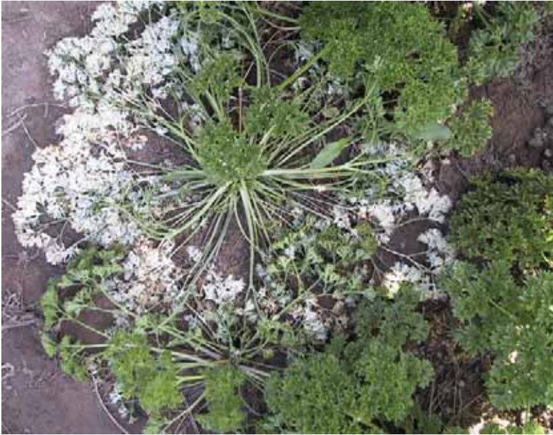
Above ground collapse and bleaching of parsley foliage