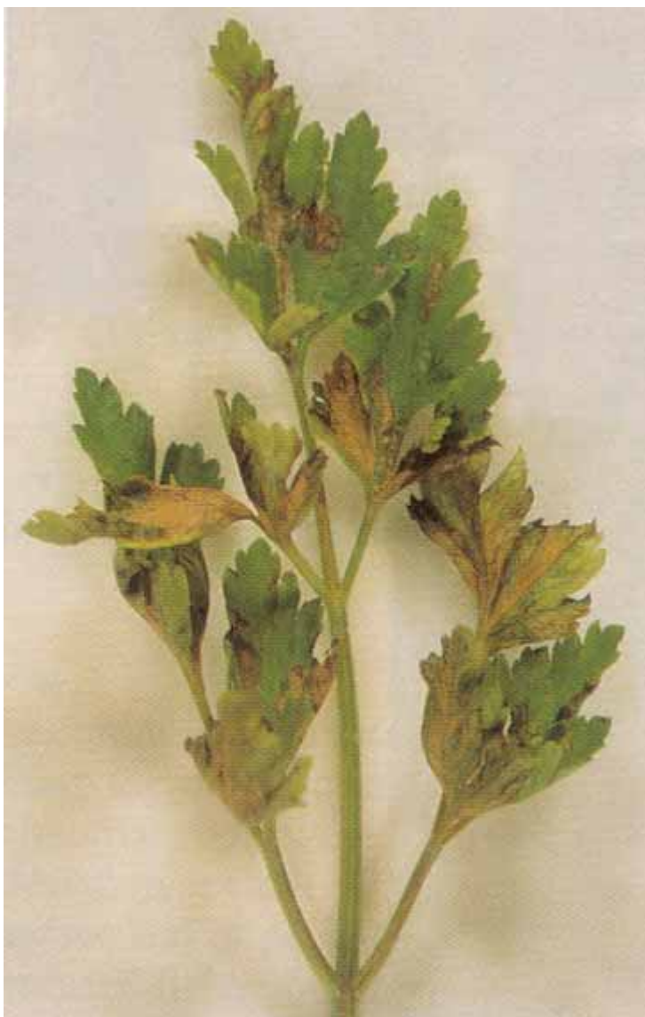
Bacterial leaf spot