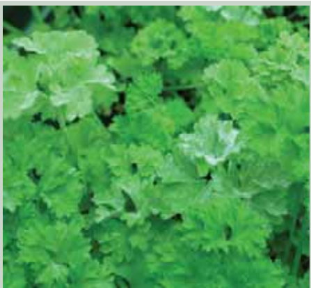
Powdery mildew in parsley bunch