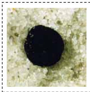
A sclerote 0.3-1.0 cm long