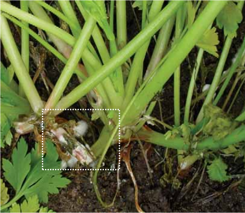
Sclerotinia rot, note white cottony mould