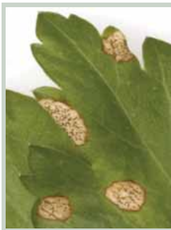
Note black spots inside lesions