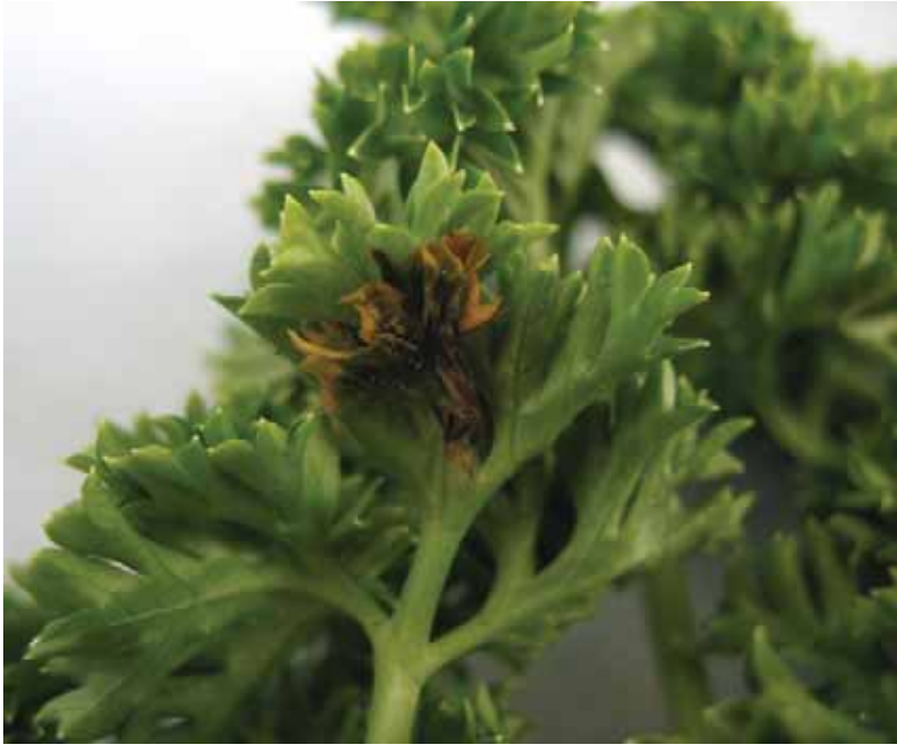
Alternaria petroselini blight