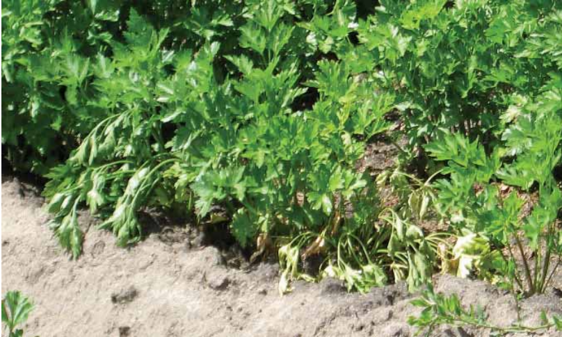
Rapid wilt of foliage (left) and collapse of shoot (right)